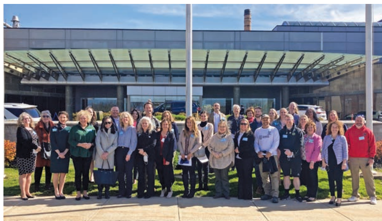
Staff of Newport Hospital is joined by representatives from the local organizations awarded "Powered by Prince" grants in celebration of this year's funding announcement.