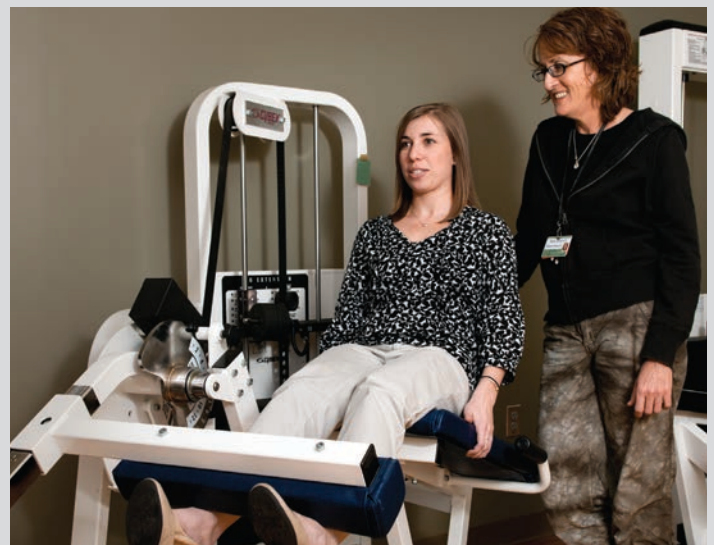
Patient at Vanderbilt Rehabilitation Center