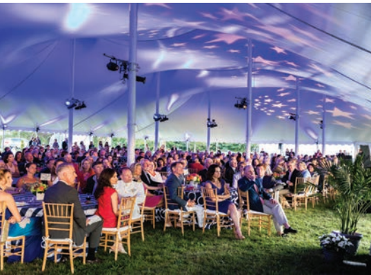
More than 400 friends of Newport Hospital gathered at the Eisenhower House