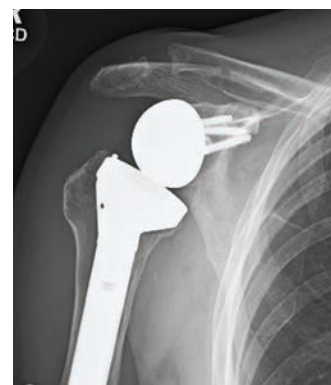
Dora's post-replacement x-ray