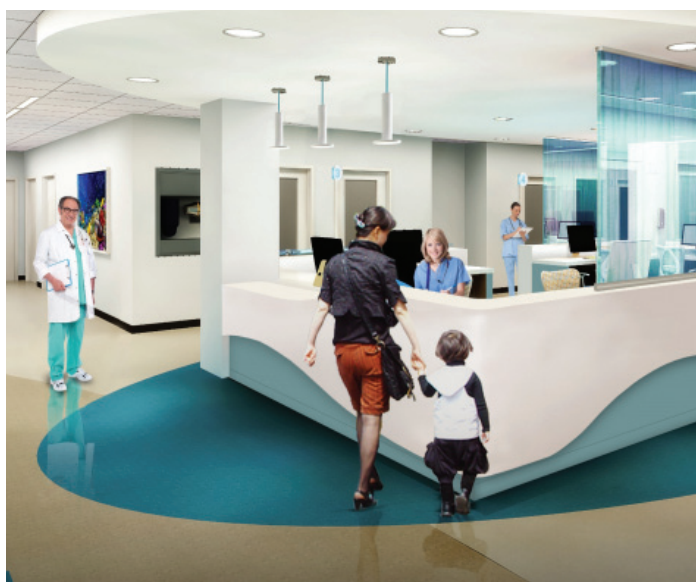
ED nurses station

Creating an advanced healing environment throughout the emergency department is a pillar of the