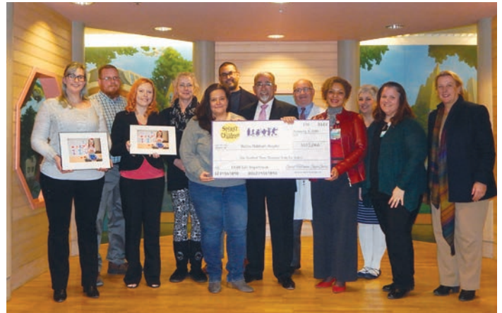
Spirit Halloween staff and HCH leadership

Funds raised through Spirit of Children benefit our Child Life Services program, which helps provide young patients with a sense of normalcy during hospitalization by engaging in play, storytelling, arts and crafts, and music. Since 2011, Spirit of Children has raised $440,998 for Hasbro Children’s Hospital.