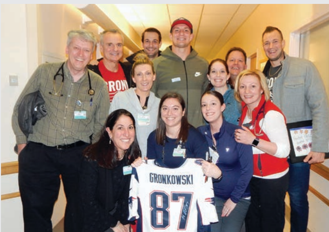
Hospital staff with members of the Gronkowski family

N ew England Patriots' star Rob Gronkowski scored many touchdowns during his illustrious career. But when he "touched down" at Hasbro Children's Hospital in February 2018, he did more than put six points on the board for our hometown team—he helped support the hospital's mission of providing the highest quality of compassionate care to kids during their time of greatest need.