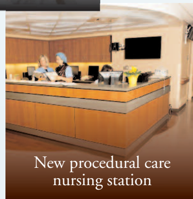
New procedural care nursing station