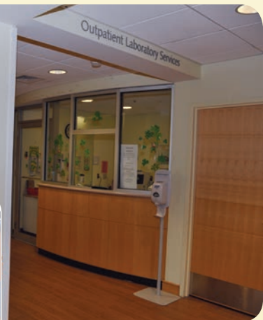
Outpatient Laboratory Services