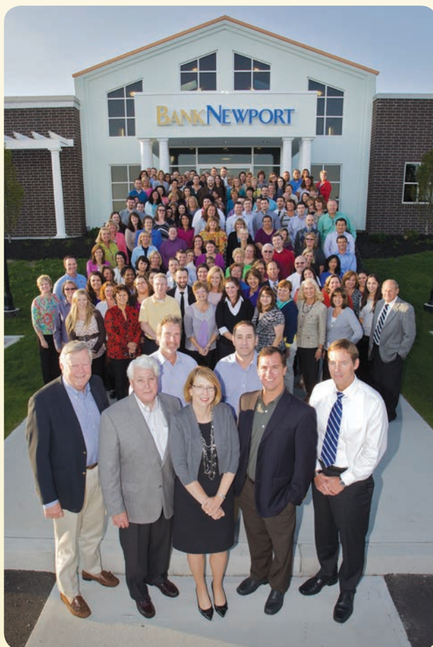
The BankNewport team