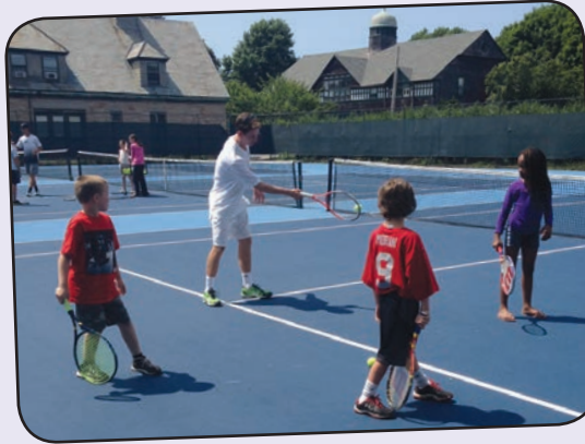
International Tennis Hall of Fame Junior Tennis Clinic

Star Kids Scholarship program provides after school and summer activities for at-risk children enrolled in the Star Kids Scholarship program.