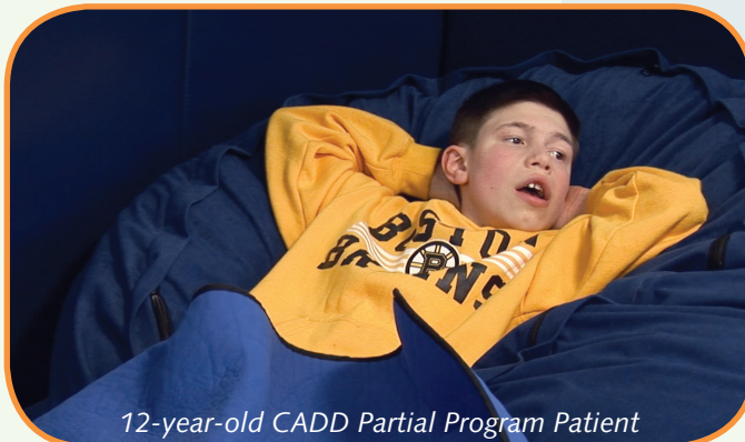
12-year-old CADD Partial Program Patient

The partial team, which includes child psychiatrists and psychologists, psychiatric nurses, a pediatrician, master's level clinicians, behavior specialists, occupational therapist, speech and language pathologist, milieu associates, nutritionists and support staff, works closely with the patient and parents to modify behaviors and establish consistent techniques for addressing each patient's unique issues. The child's school is also contacted and encouraged to participate, ensuring everyone is on the same page.