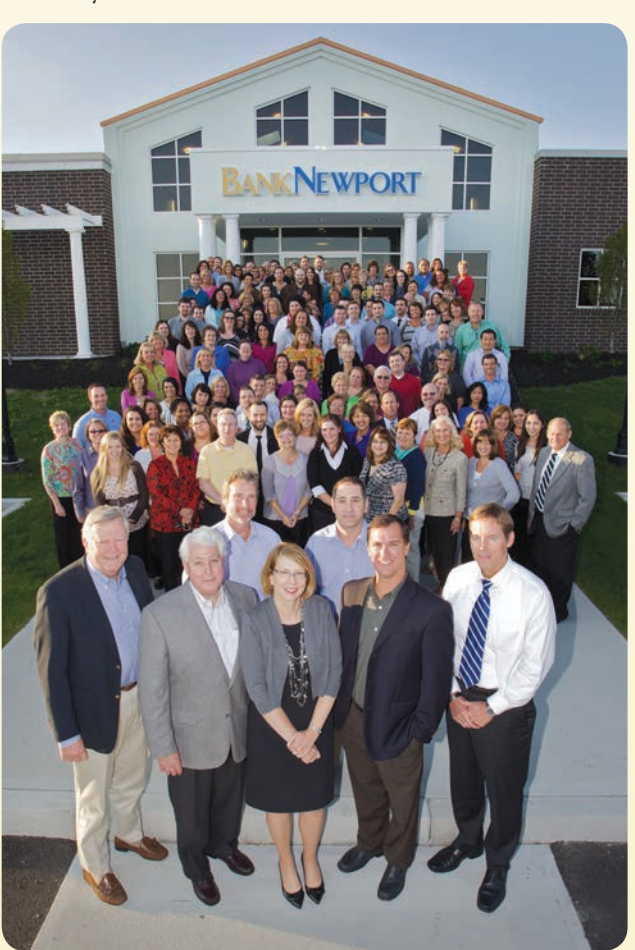
The BankNewport team

BankNewport's corporate culture of philanthropy encourages branch staff and their customers to get involved in giving back to Newport Hospital. In 2001, 26 bank employees volunteered their time to promote awareness of Newport Hospital's Vision 2001 Capital Campaign and brought in an additional $250,000 in pledges and donations from local businesses. On designated "dress down days" BankNewport employees can dress casual in exchange for making a donation to selected local organizations. Newport Hospital's Vanderbilt Rehabilitation Center Survivorship Training and Rehabilitation (the STAR Program<sup>®</sup>) has been a beneficiary of this program.